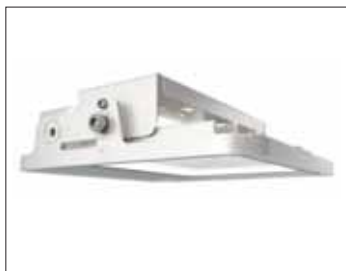
Cod. RL04/PL Accessorio per installazione a plafone Accessory for ceiling installation