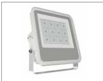
Cod. RL04/S Accessorio staffa Bracket accessory