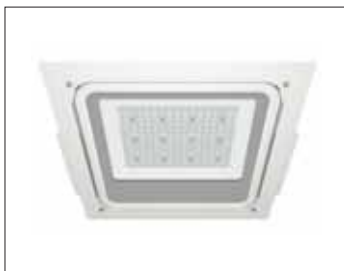
Cod. RL04/R Accessorio per installazione a incasso Accessory for recessed installation