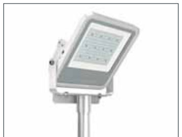
Cod. 703952.NEW Attacco palo per 1 o 2 proiettori, Ø60/76mm Pole attachment for either 1 or 2 floodlights, size Ø 60/76mm.