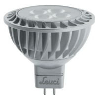
- 1 -