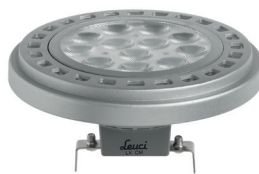
- 4 -