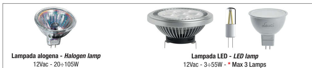
Lampada alogena - Halogen lamp 12Vac - 20÷105W

Cod. RP0711 Emergenza per lampade LED a 12V (Pag. 55) Batteria da ordinare separatamente (Cod. 00PB0800) Emergency for LED 12V LED lamps (Page 55) Battery to be ordered separately (Cod. 00PB0800)