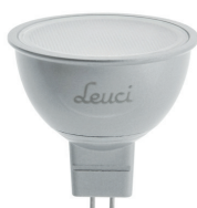
- 2 -