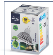
Astuccio normale Normal Pack