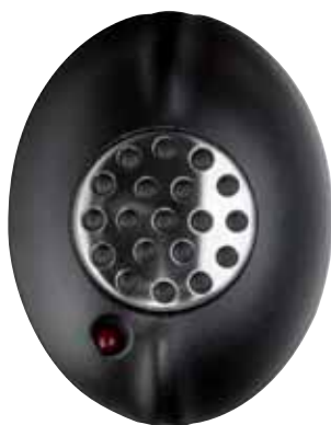
CROSS LED F-N Cod. RL0015/LAMPS