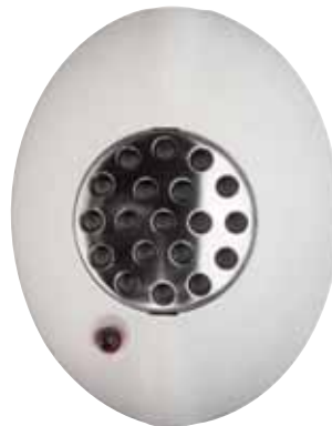
CROSS LED F-B Cod. RL0023/LAMPS