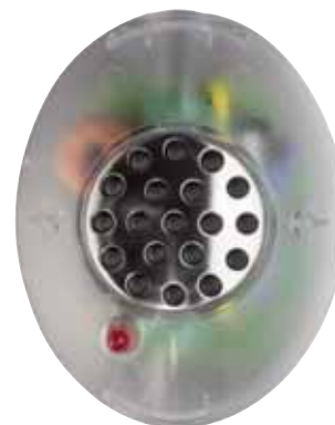
CROSS LED F-T Cod. RL0038/LAMPS