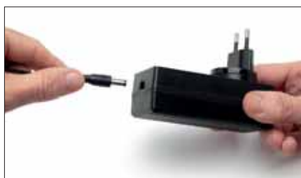
Innesto rapido tramite jack Rapid connection via jack